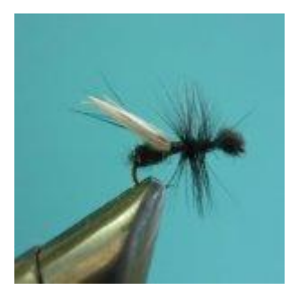
Ant dry black and red Hook size 16 - 20