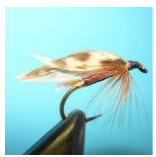
March Brown wet Hook size 10 - 14