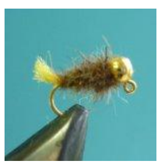
Goldnymph color brown, beige or grey Hook size 16 - 20