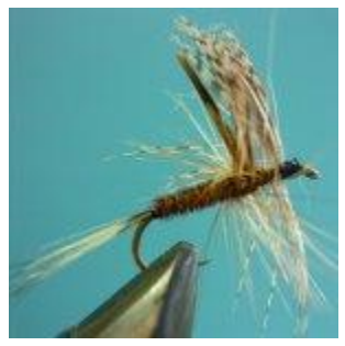
March Brown dry Hook size 12 - 16