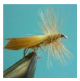
Sedge fly dry tan Hook size 12 - 16