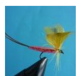
Mayfly dry, color yellow and Mayfly wet, Preska orange, Hook size 10 - 14