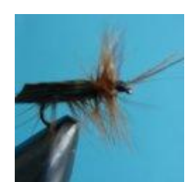
Sedge fly dry Hook size 14 - 18