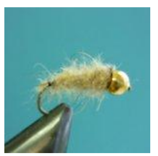
Goldnymph color brown and beige Hook size 14 - 16